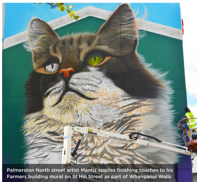
Palmerston North street artist Mantis applies finishing touches to his Farmers building mural on St Hill Street as part of Whanganui Walls

For more street art photos and to view progress videos from the festival, check out the Whanganui Walls Facebook page at: www.facebook.com/whanganuiwalls