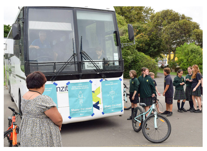
Share The Road's key messages for young cyclists - keep control of your bike and the situation, ride to be seen and to be predictable, and choose safe routes

"This is a great collaboration between agencies to help our rangatahi, and it's also timely now that the new bus service Te Ngaru The Tide is operating in our city."