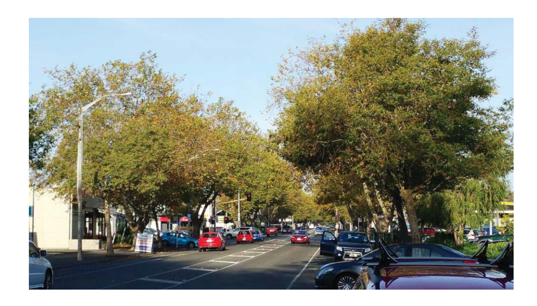
Upper Victoria Avenue, Whanganui 2106

these trees. The policy required removal and replacement after approximately 10 years to avoid major damage to infrastructure.