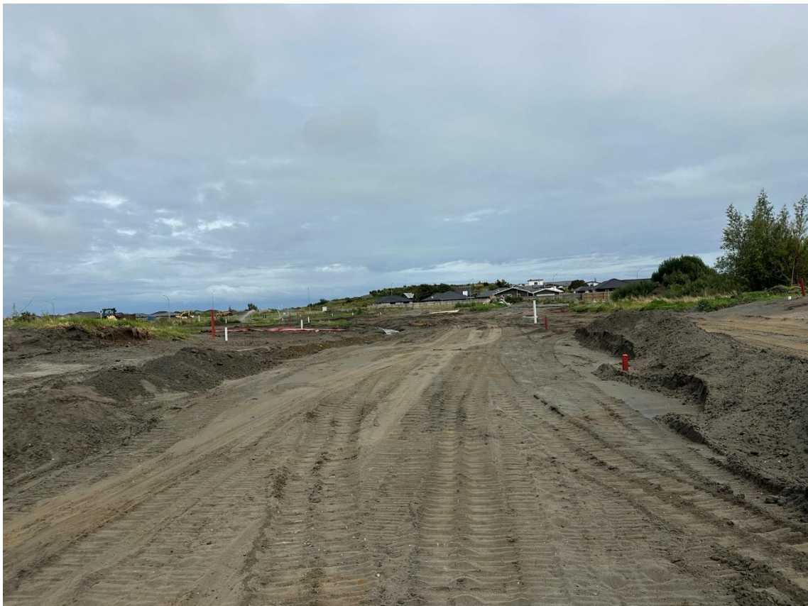
Figure 10 : Site looking south from SWMH4.