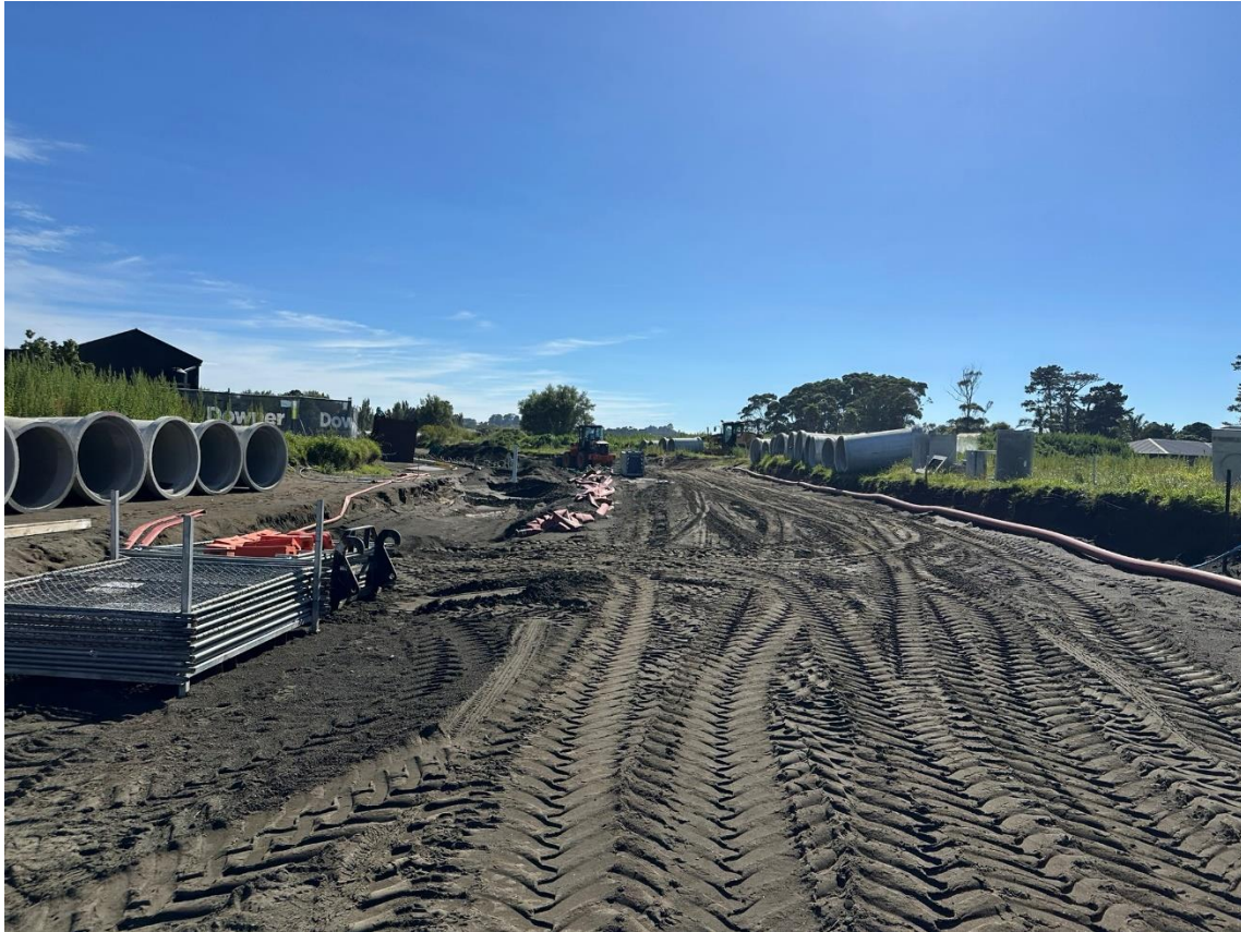
Figure 9 : Site looking north from WWMH6.