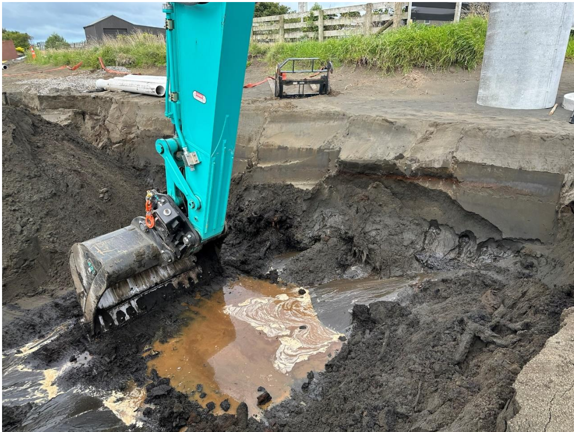
Figure 7 : Ground water and organic material encountered in the WW line excavation.