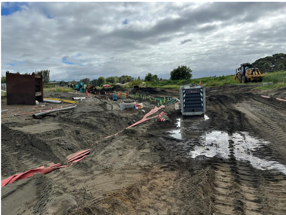
Figure 8 : WW works, looking north at WWMH7a.