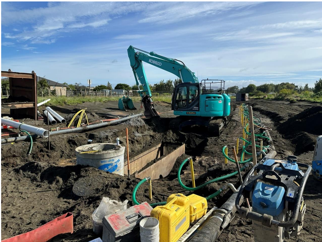
Figure 4 : Installing WW main between WWMH7a and WWMH8.