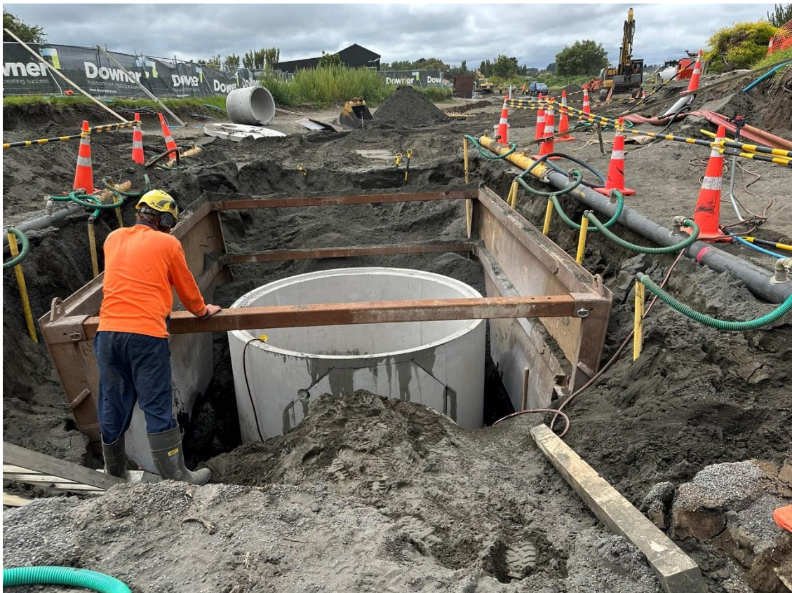
Figure 2 : Installing SWMHXY.