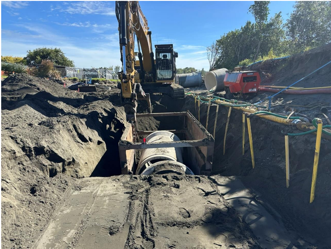
Figure 1 : Installing SW pipe between SWMH4 and SWMHXY.