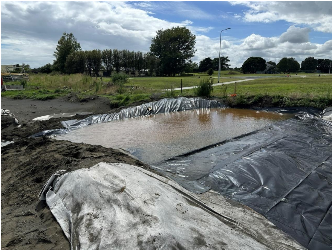
Figure 6 : Polythene-lined SRP forebay filled with water.