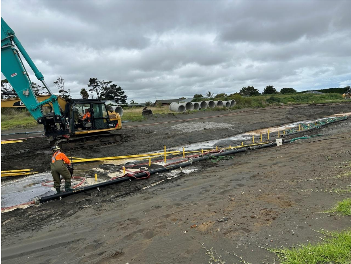
Figure 3 : Dewatering along WW line.