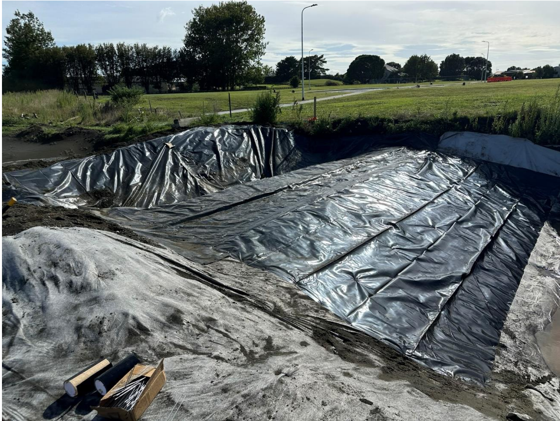
Figure 5 : SRP forebay lined with polythene.