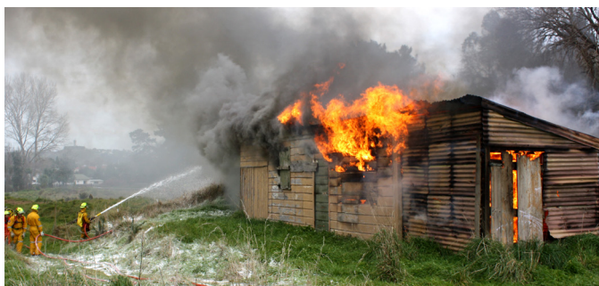
The Rural Fire Service at training in Aramoho, Wanganui