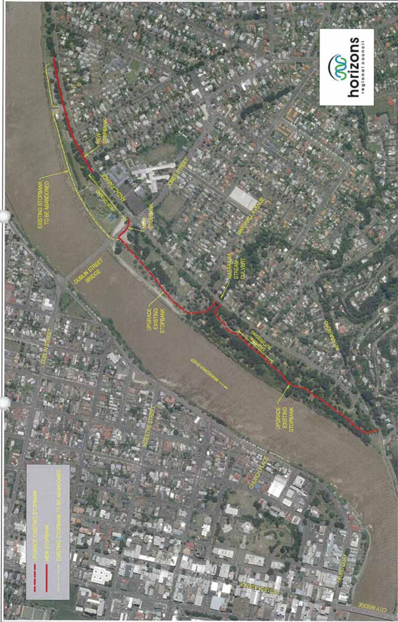
Annex 5B - Kowhai Park Stopbank