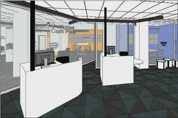
Concept drawings of the planned refurbishments at Whanganui District Council showing computer and customer care pods