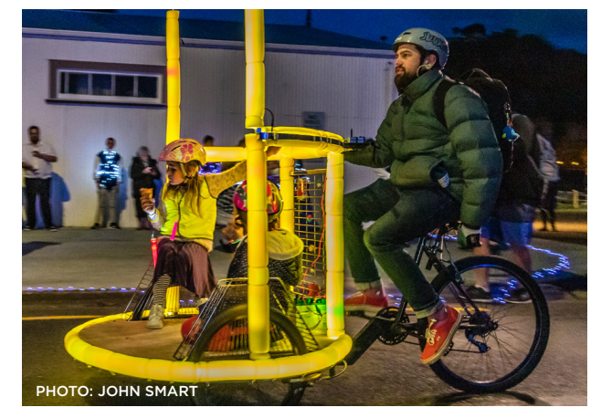
Weaving its way alongside the Whanganui River and through a glowing Kowhai Park, more than 500 people turned out with illuminated bicycles, scooters, roller skates, buggies and more for this year's Lights On Bikes parade on Friday, 27 September. A shining example of a community event!