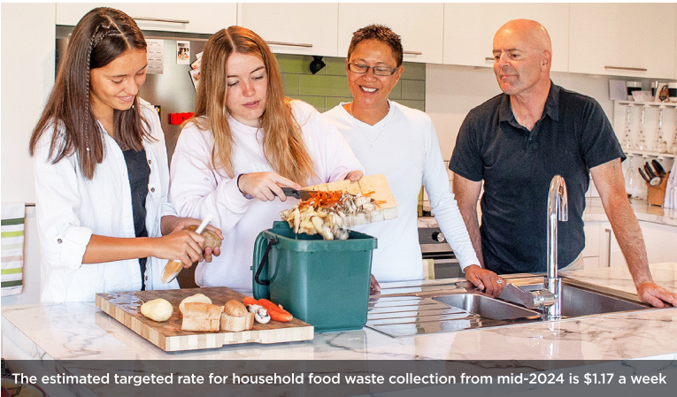
The estimated targeted rate for household food waste collection from mid-2024 is $1.17 a week

The services would be introduced to the Whanganui city urban area and Fordell, Marybank and Mowhanau villages. The targeted rate for households in the collection areas would be $2.58 weekly for recycling (from mid-2023) and $1.17 weekly for food waste (from mid-2024).