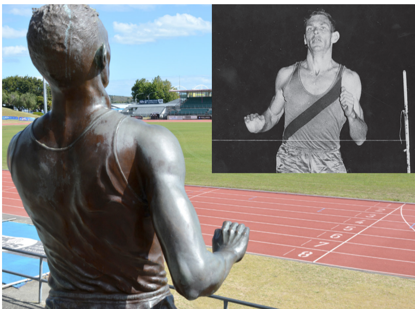
Sir Peter Snell’s statue in Cooks Gardens forever looks on to the finishing line of the athletics track. Inset: Sir Peter sets a new world mile record at Cooks Gardens in January 1962

“Sir Peter is New Zealand’s Sports Champion of the 20th Century and his record-breaking world mile at Whanganui 58 years ago will be inscribed forever as one of the most remarkable and memorable occasions that the people of Whanganui have ever witnessed.”