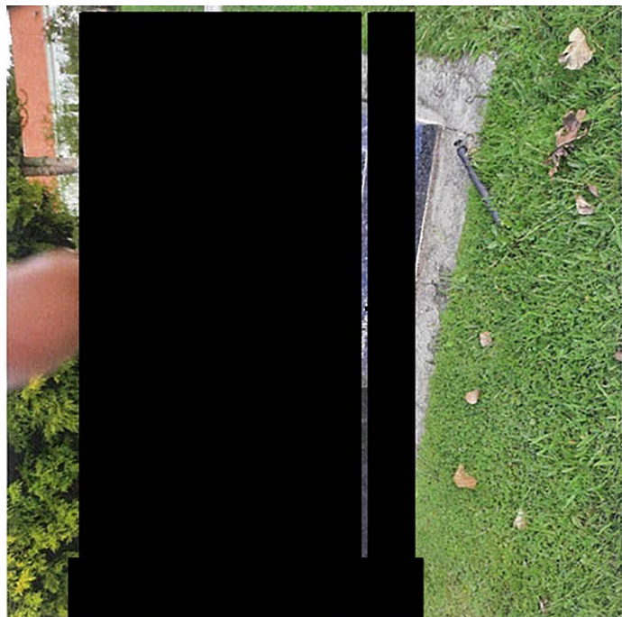
Taller cremation Headstones (1)