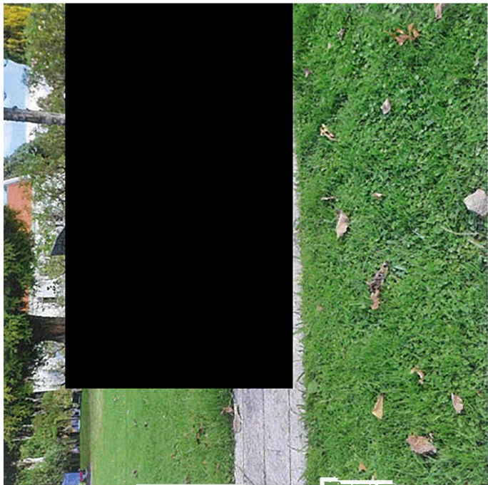
Taller cremation Headstones (2)